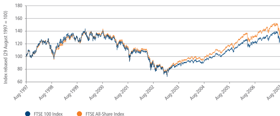
Source: FTSE Group, data as at 31 August, 2007